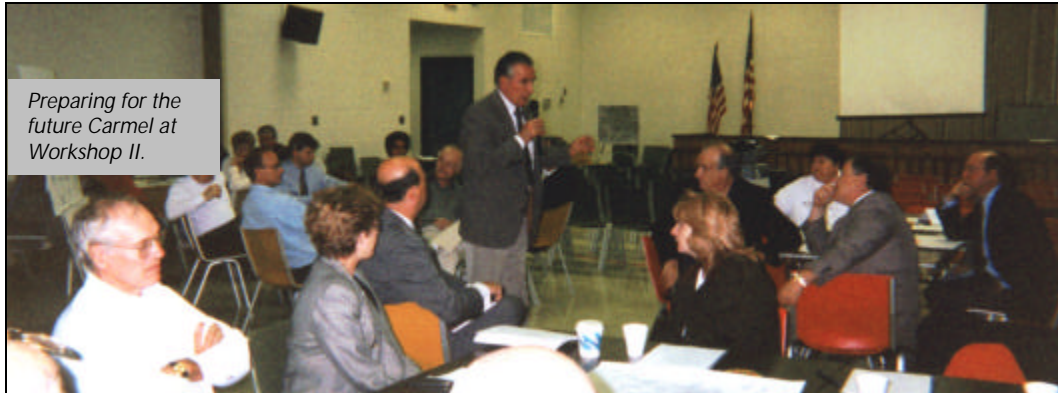
Preparing for the future Carmel at Workshop II.

The first workshop introduced the planning concepts and program to the public. Participants contributed their vision of the future of the Town. At the second workshop, a conceptual land use plan and background report was presented with participants working in breakout groups toward consensus on the most significant issues.